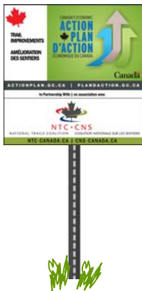
12 x12 Single Post Mount